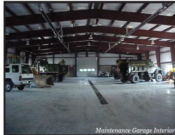
Maintenance Garage Interior