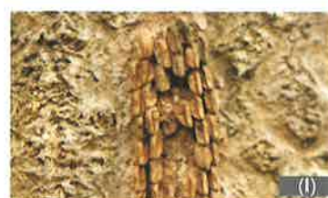
(A) Spotted lanternfly adult showing the forewings and hind wings (B) Adults at rest on bark (C) Lateral view of an adult (D) 1st instar nymph (E) 4th instar nymph (F) Adult feeding on wild grape, Vitis sp. (G) Weeping sap trail on bark (H) Egg mass (oothecum) covered in coating (I) Old hatched egg mass on tree trunk.