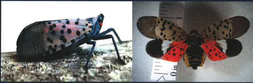
Adult Spotted Lanternfly, present in autumn months.

If you find any of these life stages of the Spotted Lanternfly, remove, devitalize, place in a sealed bag, and dispose of bag in the garbage.